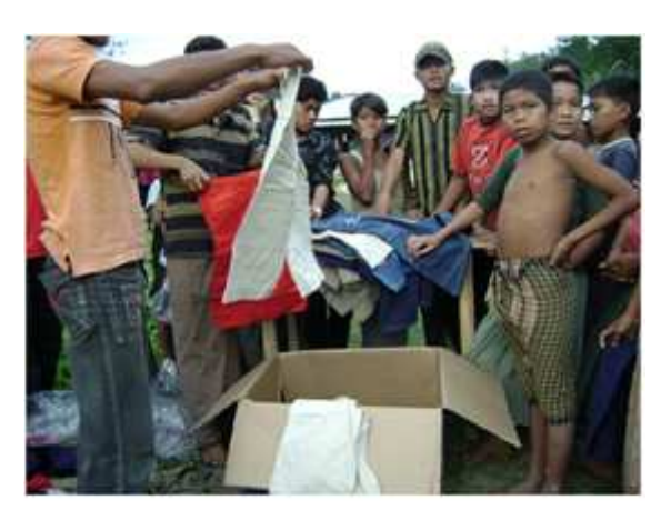
Distribution of Clothes