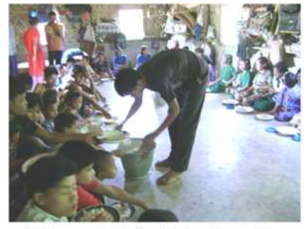
Children are taking food in dormitory as they have no dining hall

of the hostel or repairing say, procurement of materials, engagement of necessary labor, and supervision of construction work being accountable Management Committee (EC). Specially it will construct dormitory for girls, kitchen, toilet/Bath, dining hall, and install a deep tube well, water supply to ensure safe water for the children under the project.