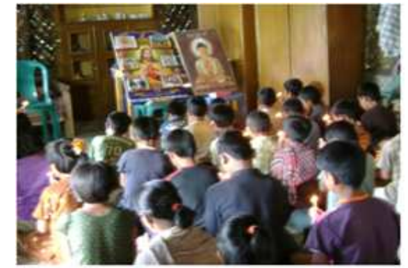
Children observe both Christian & Buddhist theme

3.3 Organize regular sports, cultural & religious event: every day regular sports and religious prayer and at least weekly cultural events shall be organized by the care taker of the Hostel to provide them recreation facilities as well as to develop their cultural & religious mentality.