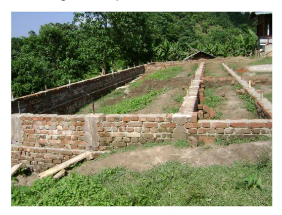
Incomplete Construction of girl dormitory

minded youth and some Buddhist monks. I also got cooperation from the parents of children as well as community people toward establishment of the children home. In the mean time I am trying my label best to get support from local source and able to collect financial support and contribution locally from different sources like; from friends circle, prominent rich men. Thus with my own financial involvement and locally collected donation I was able to construct a dormitory and office and the kitchen. In addition our community people provided