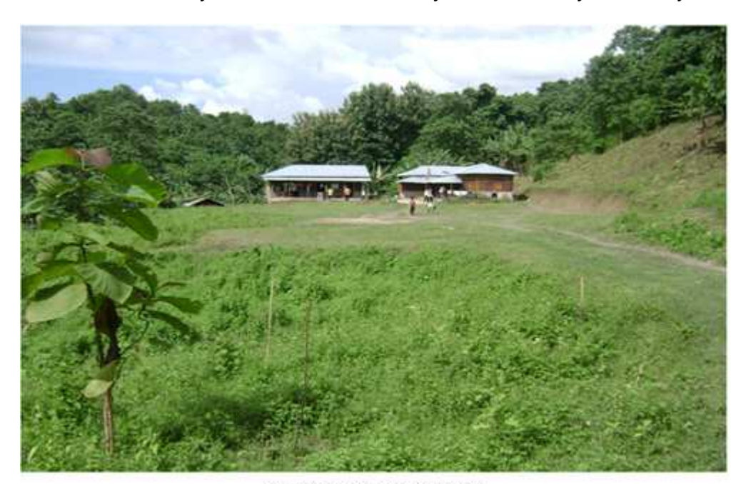
Hill Child Home at present

Tribal communities lost their own heritage, which threaten their existence. Situation obliged them to slowly and steadily losing their language, culture, customs and tradition. Adivasi/tribal minorities have no ability for policy or decision influencing which badly affects day to day life and livelihood. Therefore they are victims of social, political and economic discrimination and injustices. Children and women rights situation is most awful. They are deprived from education, health, nutrition, safe drinking water and sanitation as results they are victims of mortality and morbidity, disability, discrimination.