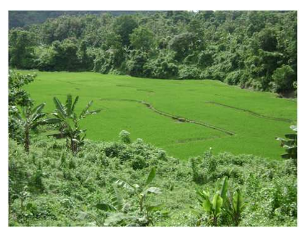
Hill Child Home will follow this model toward sustainability